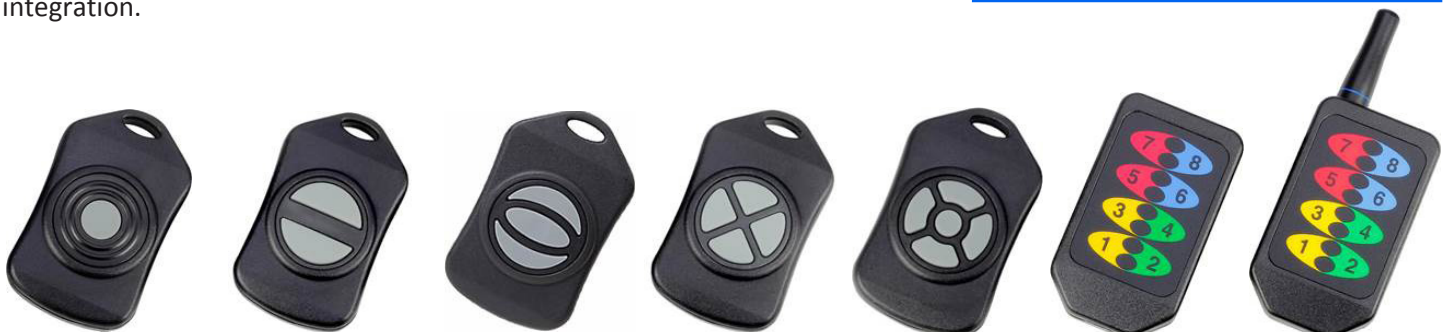
Optional Single and Multi-Channel Key Fobs Available at Additional Cost