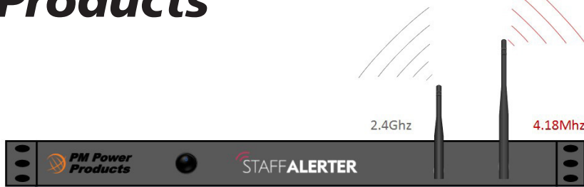
Shown With Optional Wireless Key Fob System

StaffAlerter™ from PM Power Products provides users with a powerful, flexible, completely programmable Mass Alerting application to process action inputs and notify selected personnel during an emergency or time of crisis.